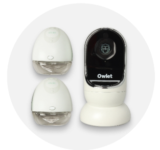
Baby & Mom