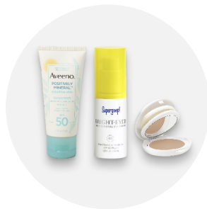
Acne & Skincare